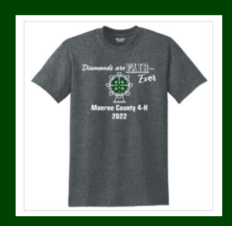
Fair Theme Design for 2022

Link to online store: <a href="https://monroecounty4h.itemorder.com/shop/sale/">https://monroecounty4h.itemorder.com/shop/sale/</a>