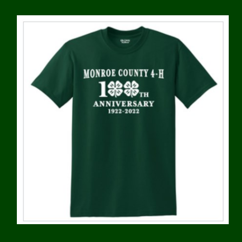
Centennial Celebration Design

New this year, there are options of t-shirts, long sleeves, and sweatshirts!